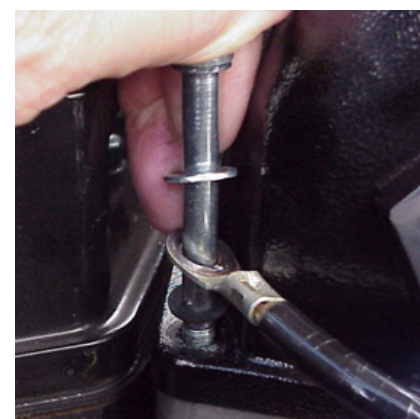
Figure 3 - Installing Ground Wire, Note Rubber Washer Below Ring Terminal