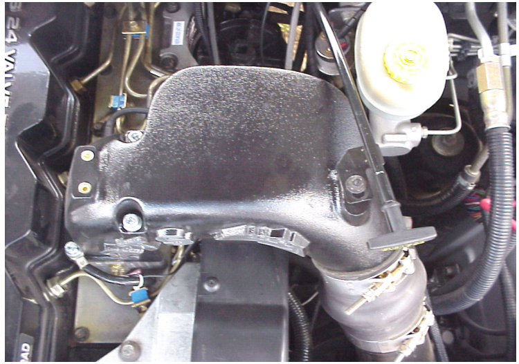
Figure 4 - Arc-Flow Intake Manifold After Installation

Note: Figure 4 shows a 24V Cummins, but 12V and Commonrail models look similar.