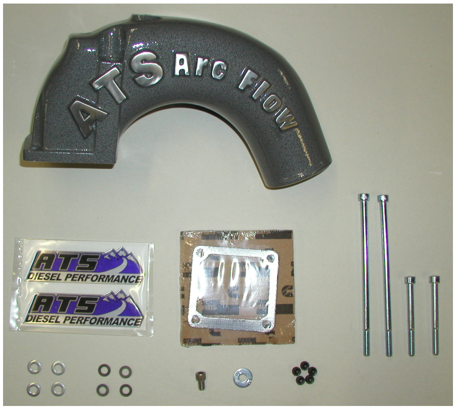
Figure 1 - 24 Valve and CR Arc Flow Kit Contents

Thank you for purchasing the ATS Arc-flow Intake Manifold. This manual is to assist you with your installation. If installing for a customer, please pass this manual on to your customer for future reference.