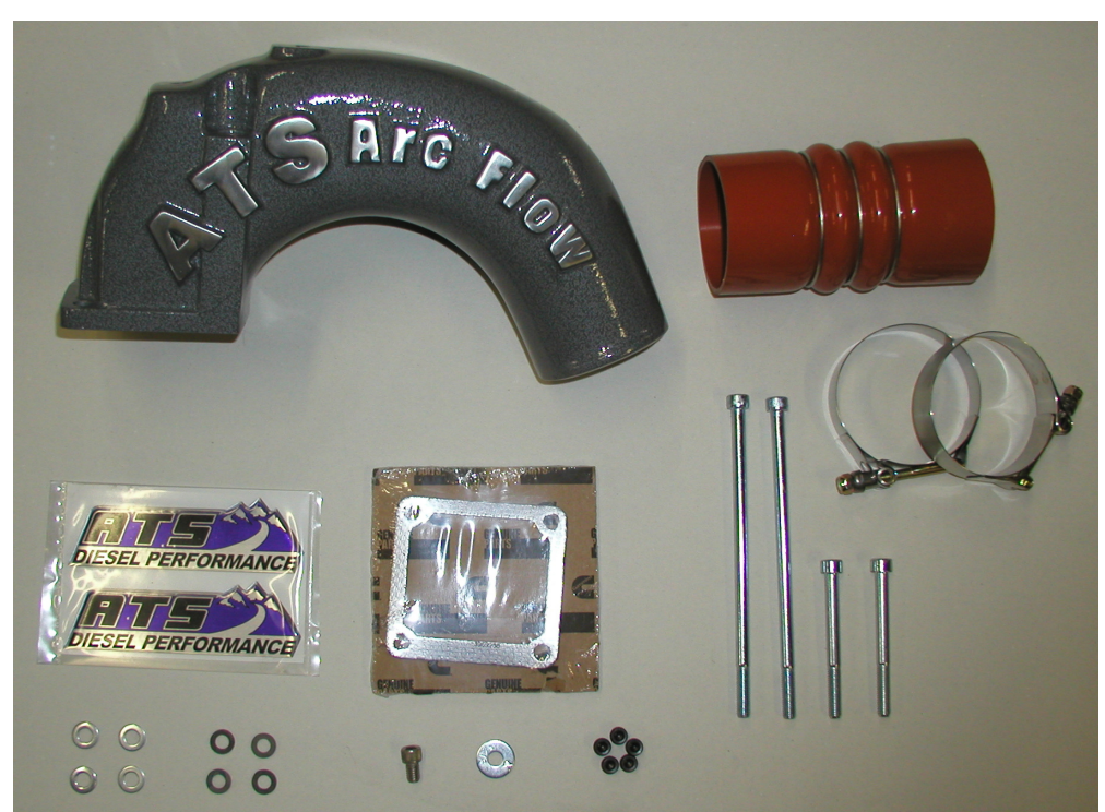
Figure 1 - CR Arc Flow Kit Contents

Thank you for purchasing the ATS Arc-flow Intake Manifold. This manual is to assist you with your installation. If installing for a customer, please pass this manual on to your customer for future reference.