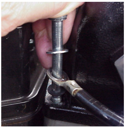
Figure 3 - Installing Ground Wire, Note Rubber Washer Below Ring Terminal