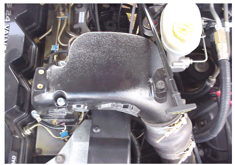
Figure 4 - Arc-Flow Intake Manifold After Installation

Note: Figure 4 shows a 24V Cummins, but 12V and Commonrail models look similar.